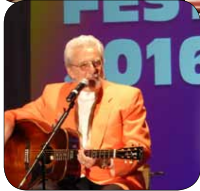
Special Guest, Don Ciccone

Organ Fest 2016 featured an incredible line up of world renowned artists: