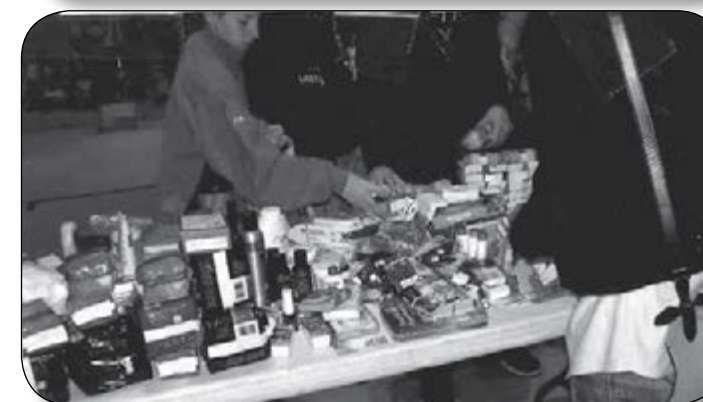
Sorting Food Items for Packing