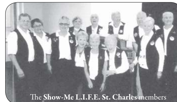
The Show-Me L.I.F.E. St. Charles members