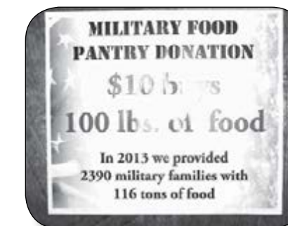
$10 buys 100 lbs. of food