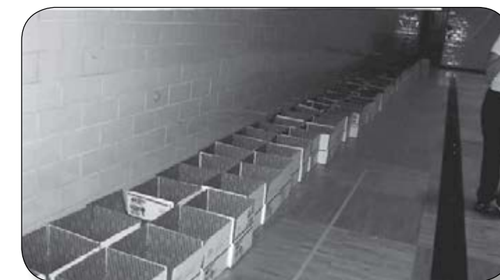
Boxes Ready for Filling