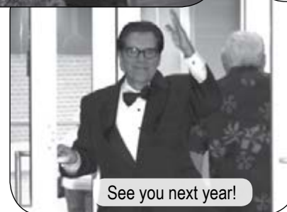
See you next year!