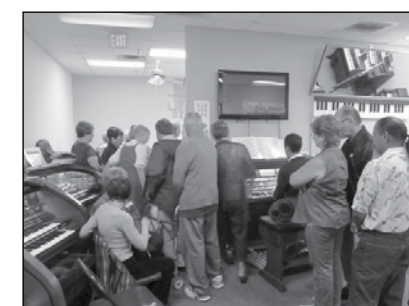
Overflow into the store