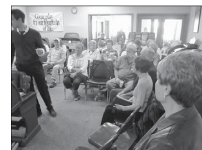
Full house for the concert