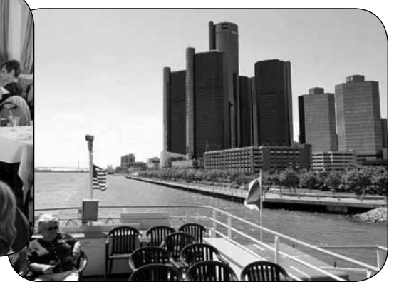
The U.S.A. Side of the River