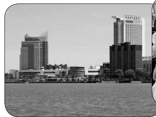
The Canadian Side of the River