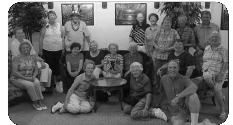
Friends For L.I.F.E. Chapter at the Senate Theatre