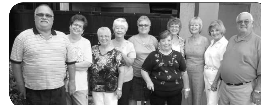
Newly elected Derby City L.I.F.E. officers: