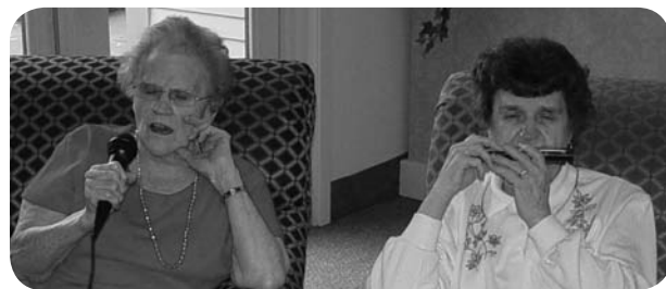
Residents chiming in with our playing.

n' Save in Greensburg and are currently spreading the holiday spirit at the grand opening of a Giant Eagle Supermarket in Harrison City. The "Sparks of L.I.F.E." would like to wish everyone a happy, healthy, and musically inspired, new year!