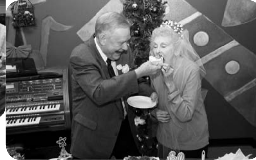
Let the 'reception' begin! It wouldn't be official without cake, of course!