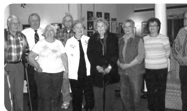
Members of Treasure Valley LIFE