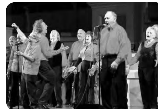
The Young@Heart Chorus

What we're aiming for is our own version of a 'Young@Heart Chorus' type of video. If you haven't heard of or seen this amazing 'young' group - you should! It's a wonderful group of active adults who've taken up 'performing' and singing newer 'Rock-N-Roll' songs that you wouldn't expect they'd sing. Their mantra? They don't let age slow them down - because they love life! (Hey, where have we heard that before?!)