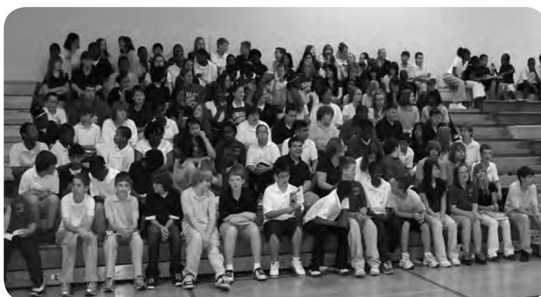
Over 300 band and orchestra students took part in the 'surprise'.

Through the incredible efforts of all LIFE Members who participated in the 'Kids Need Music' program that we held last year (remember those orange wrist bands we were selling?) The Mr. Holland's Opus Foundation (MHOF), a non-profit organization that supports music education programs in schools nationwide, surprised students at the Farnsley Middle School in Louisville, KY with the donation of $25,000 worth of instruments to the school's music program.